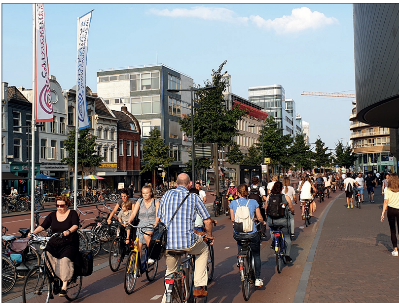
Figure 2: Utrecht, Netherlands, a progressive city that prioritises sustainable and healthy mobility

A better, more health-oriented narrative of climate action might help, particularly if immediate health benefits could be shown. But we also need a more integrated and holistic vision of what our cities should be and should look like to capture the imagination of politicians, decision makers, and citizens and change their behaviour (figure 2). This vision is often still missing. A shift away from our car-centric planning and more greening are essential.